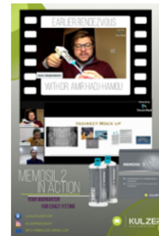
Example of a webinar