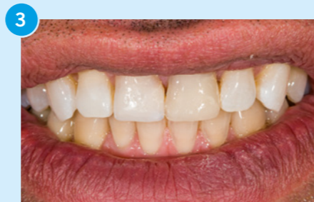
3 Using the pre-selected shade of Venus Diamond (in this case A2), a direct intra oral mock-up was made without the use of bonding. The palatal form and the occlusion were adjusted. The aesthetic parameters of the mock-up should be assessed at this stage. After finalising the mock-up, a silicone putty index can be made chair side.