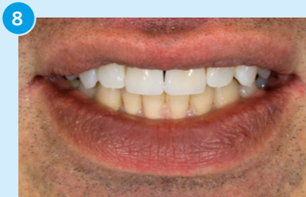
8 Final restoration. View of the patient's smile illustrates balance of form and harmony