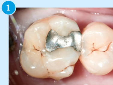
1 59-year-old male patient presenting a secondary caries on the amalgam restoration of tooth 26.