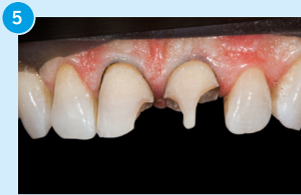
5 The composites were removed, and a very fine facial reduction was performed on teeth 11 and 21.