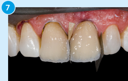
7 Venus Diamond OM was used to replicate the mamelon anatomy and mask the tooth and composite interface. Then, Venus Diamond Universal A2 was applied. Finally, a thin layer of Venus Diamond Incisal CL was applied to the facial surface, to add depth to the restoration.