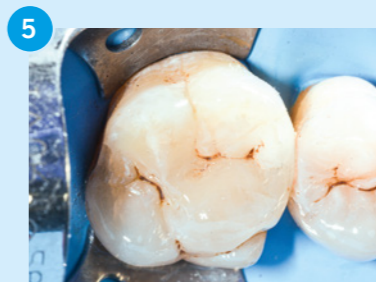
5 Fissures were characterised by a brown staining resin.