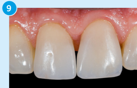
9 Perfect results even after 19 months of use without polishing.