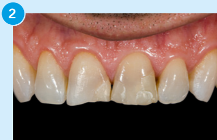
2 Pre-operative view of the upper teeth to assess the aesthetic situation. Both upper central incisors vital and had no signs of root problems on radiographic examination.