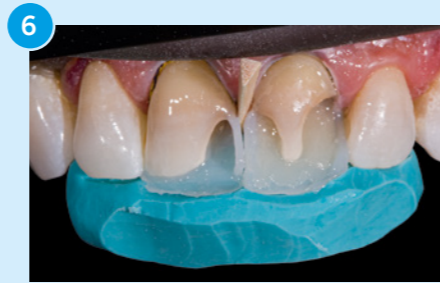
6 The index guides the first layer of Venus Diamond Incisal CL (clear) to form the palatal wall. Metal matrix strips were used to separate the teeth, to prevent the restorations from being splinted together. Tooth 21 also had a thin layer of Opaque Medium Dentine applied, Venus Diamond OM, to reinforce the weak palatal shell of composite.