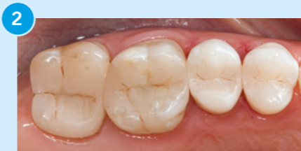
2 Post-operative view of the upper left quadrant restored with Venus Diamond direct composite restorations (except tooth 26). Teeth 24 and 25 had the definitive restorations whereas teeth 26 and 27 were due to have crowns placed at a future date.

This example shows an alternative treatment strategy for the COVID-19 times. Extended direct fillings can be placed as a long-term provisional to postpone indirect restorations