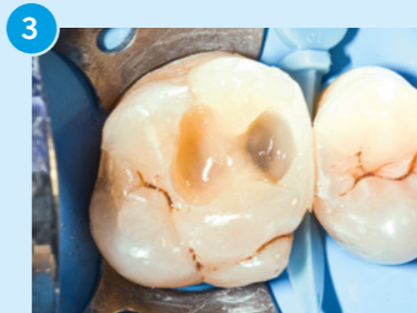
3 The cavity was bonded using iBOND Universal after a selective enamel etching. Venus Diamond ONE Shade was used to restore the proximal wall. After light curing, the dentine was covered by a 0.5mm thick Venus Diamond Flow layer.