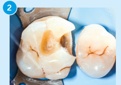
2 After rubber dam application, the cavity was excavated and prepared.