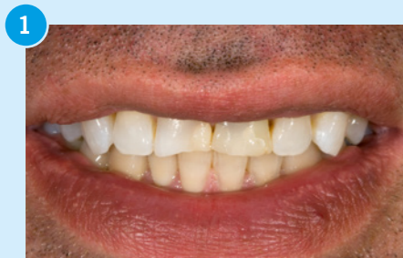
1 Pre-operative smile view. Patient requested only direct composite restorations. Due to the extent of the cavities, the patient was informed that indirect restorations such as crowns would be more appropriate.

A male patient presented with two incongruous restorations in teeth 11 and 21. The complete incisal edges and the labial surfaces were replaced by composite. Discolouration, marginal insufficiency, fractures, and severe wear were detectable. From the clinical perspective, the degree of lost tooth structure indicated indirect restorations for both teeth. The patient, a dentist himself, nevertheless asked for direct composite restorations. Due to its excellent physical properties, the nano-hybrid composite Venus Diamond was chosen.