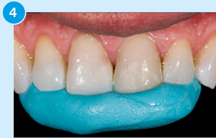
4 Index in situ, prior to being trimmed.