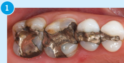
1 Pre-operative view of the upper left quadrant. The amalgam fillings were replaced due to underlying caries. Teeth 26 and 27 were both planned to have core fillings and later be finalised with crowns due to extent of the cavities.

Before any indirect cuspal coverage restorations, it needs to be ensured whether the pulpal status is still fine. For this reason, Venus Diamond direct composite restorations (except tooth 26) were placed.