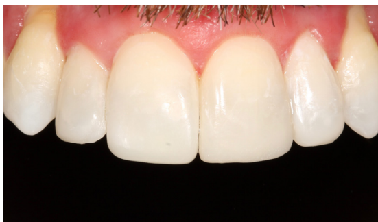
Figure 10: Kulzer Venus Diamond Flow, A1 shade and Kulzer Venus Diamond A1 were used to restore the UR2, UR1, UL1 and UL2