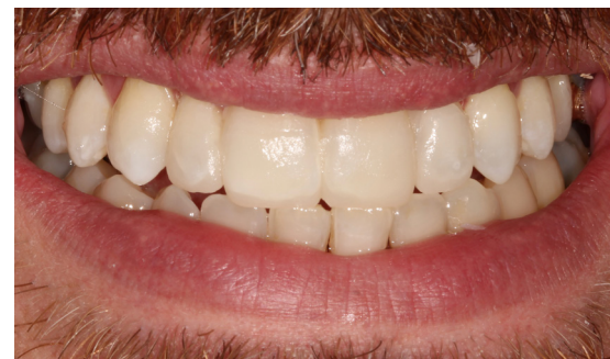
Figure 9: A mock-up was placed directly in the mouth using composite developed for temporary restorations