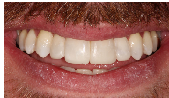
Figure 11: The outcome surpassed the patient's expectations and met the deadline