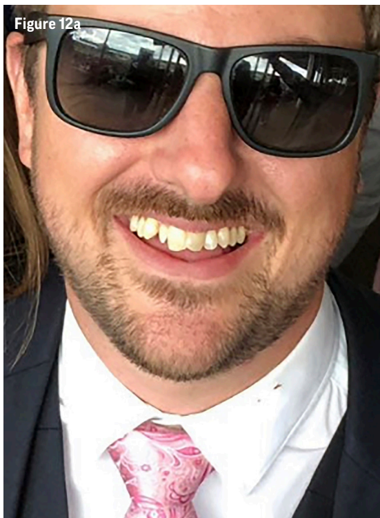
Figures 12a and 12b: Before and after. The patient was delighted with his smile on his wedding day