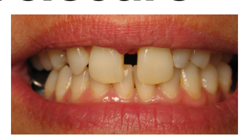
Figure 1: A female patient was unhappy with the appearance of her teeth