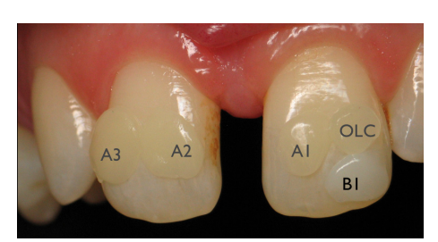
Figure 3: Appropriate shades were selected by placing 1mm increments of various enamel and dentine shades on the tooth surface

thin coat of an enamel shade at the incisal edges. Venus Pearl is a nano-hybrid, based on a tricyclodecane-urethane monomer. Consequently, it has low polymerisation shrinkage and its polishability is excellent.