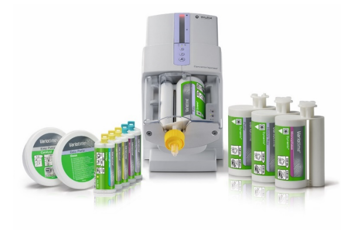
Fig. 2: The Variotime<sup>®</sup> system offers an intelligent time concept with variable working time and always short time in mouth.

Fig. 1: At IDS, visitors can create a brain impression with Variotime<sup>®</sup> at the Kulzer booth A010 – C019 in fair hall 10.1.