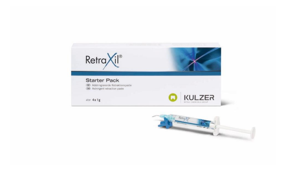
Fig. 3: Unlike some retraction techniques, RetraXil is ready-mixed and does not contain vasoconstrictors like adrenaline, but rather astringent aluminium chloride.