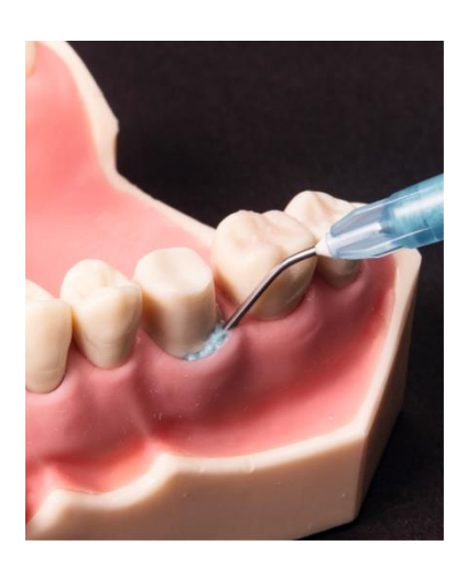
Fig. 2: The new retraction paste is applied via the thinnest-walled cannula on the market that enables precise application of RetraXil and prevents injury to the gingiva.